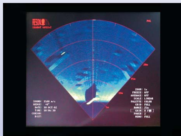
Sonar image simulation